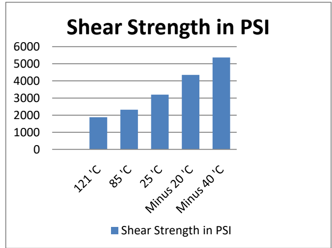
Lap Shear Strength ASTM D 1002 – Aluminum / Aluminum